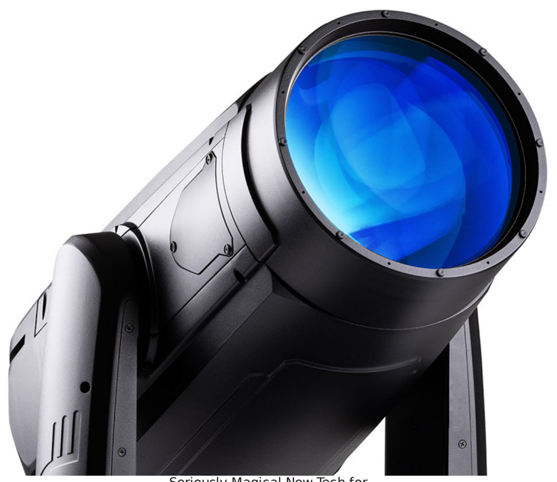
Seriously Magical New Tech for Robe at LDI!